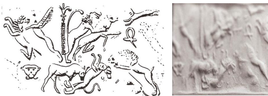
2M sealing from a seal bought by T E Lawrence at Membij, Syria (Ashmolean Museum 1913.251/AshCatl 897E) Different modes of attack around the Solar Palm Tree of the Year suggest the Four Seasons

The research topic I work on is to look into the meaning of an image showing a lion attacking its prey, a recurring subject in ancient near-eastern art. When I looked into the literature by those commenting on its possible symbolic meaning, of course the tendency is to draw on one's own background knowledge and education, whatever it might be, and fit the image to that. To some this animal group is sheer observation of nature - to others an expression of political or religious power, while just a handful saw it as the first in service of the second, both in turn reflecting astronomical cosmology. This last group tended all to come from the Victorian generation where traditional Astronomy still formed part of a curriculum based on the Seven Liberal Arts - when it was still alive as an oral tradition in country customs dealing with the Seasons of the Year. Often a quite trite interpretation is perpetuated from one scholar to the next without any questioning.