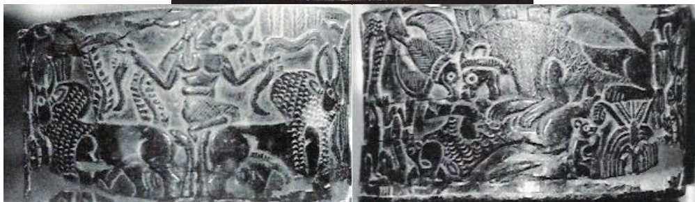
(Top) View of 3M Iranian chlorite vase said to be from Khafaje (BM ME-128887) showing two snakes held in 'master of the beasts' fashion by a standing figure of neutral sex standing on the rumps of two lionesses with tails upheld like ears of wheat (the rosette is a pointer to Inanna); (below) overview of the two further heraldic units comprising the scenes on the pot (photos author).